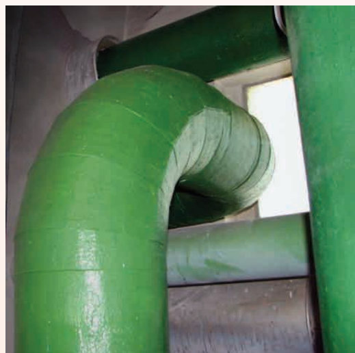
Aerogel insulation was thin enough to use on all bends in the piping and in the most confined areas. Green finish was easily applied to identify fluid inside.